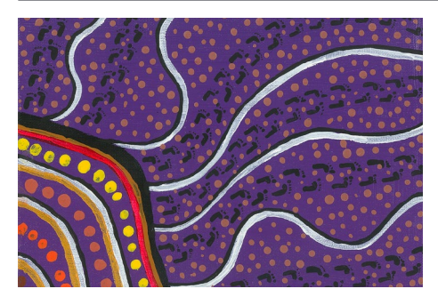
Provide every student with a pathway to a successful future.