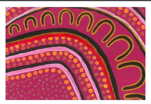
2 Strengthen support for teaching and learning excellence in every classroom.