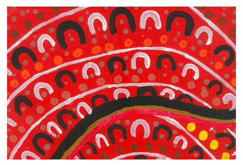
Partner with families, communities and agencies to support the educational engagement of every student.